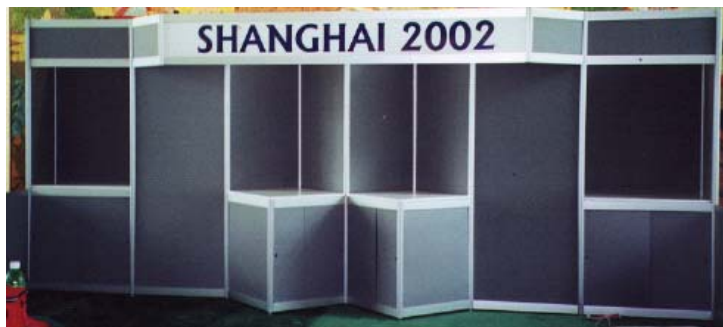
20' PERF PKG #1 W/VELCRO PANELS (similar except middle will be straight counters)