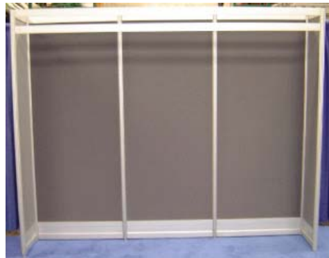
BASIC PERF PKG 10' #1