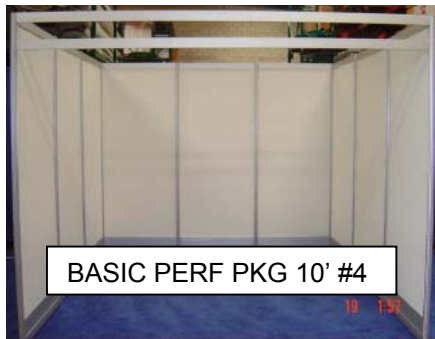
BASIC PERF PKG 10' #4