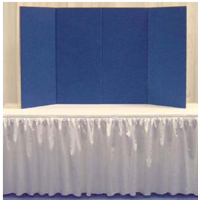
BASIC PERF PKG #1 TABLETOP