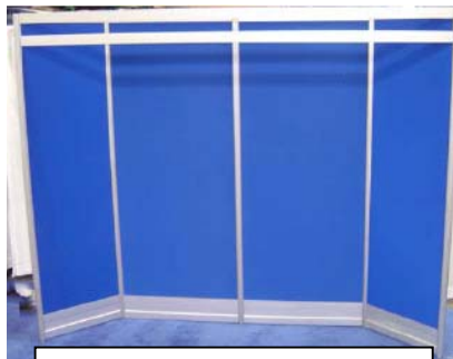
BASIC PERF PKG 10' #2