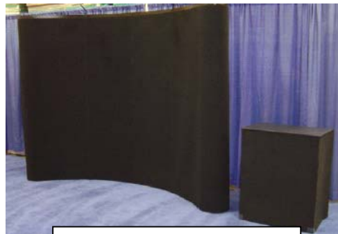
BASIC PERF PKG 10' #3